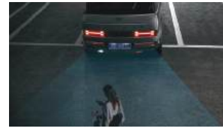
Parking Collision-avoidance Assist - Reverse (PCA-R)*