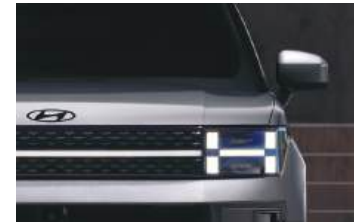
H-lights Head Lamps

The all-new SANTA FE memiliki tampilan kokoh dan performa tinggi. Rasakan pengalaman berkendara yang dinamis dengan fitur premium serta ruang kabin yang dirancang sesuai kebutuhan berkendara Anda, dari menyusuri kota hingga bertualang ke alam bersama keluarga.