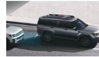
Blind-spot Collision-avoidance Assist (BCA)*