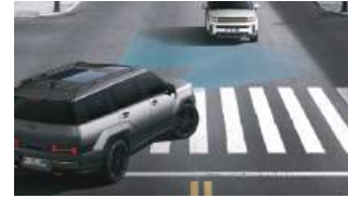
Forward Collision-avoidance Assist with Junction Turning (FCA-JT)*