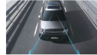
Lane Following Assist (LFA) with Hands on Detection*