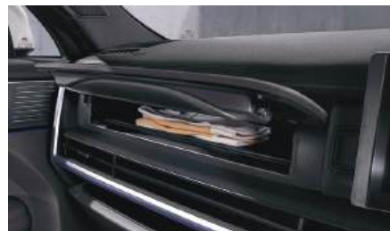
UV-C Sterilization Multi-tray