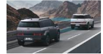
Smart Cruise Control with Stop & Go (SCC w/ S&G)*