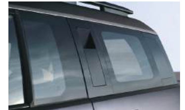
Hidden-type Assist Handle/ Quarter Glass