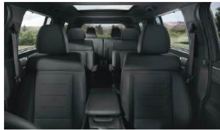
Black Monotone Nappa Leather