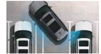
Forward/Side/Reverse Parking Distance Warning (PDW)*

*Fitur berfungsi sebagai sistem pendukung. Pengemudi harus tetap fokus dan berhati-hati selama berkendara. *Trim Calligraphy.