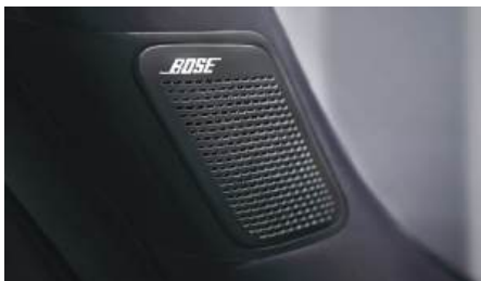
BOSE™ Premium Sound System