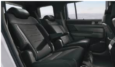
2nd-row Power Reclining Captain Seat (6 Seats)

Interior the all-new SANTA FE yang premium dan luas dirancang dengan sempurna untuk meningkatkan kenyamanan serta memudahkan aktivitas Anda di dalam kabin, menjadikan setiap perjalanan sebuah pengalaman tak terlupakan.